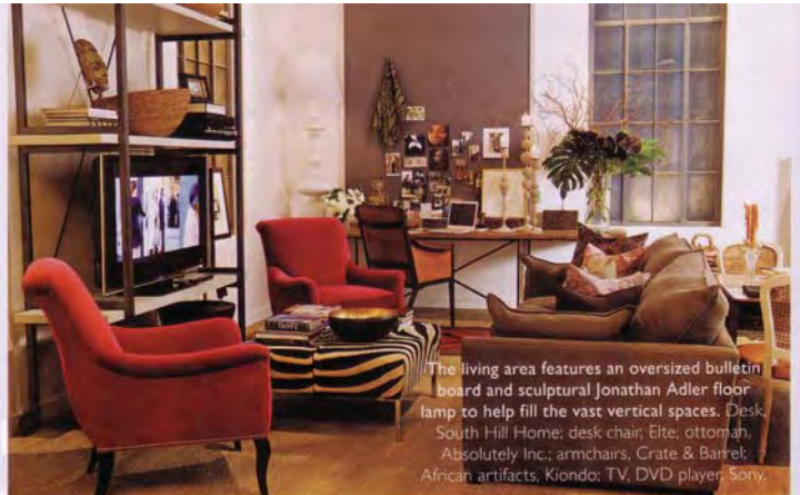
The living area features an oversized bulletin board and sculptural Jonathan Adler floor lamp to help fill the vast vertical spaces. Desk, South Hill Home; desk chair, Eite; ottoman, Absolutely Inc.; armchairs, Crate & Barrel; African artifacts, Kiondo; TV, DVD player, Sony.