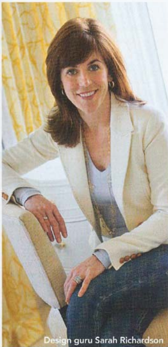
Design guru Sarah Richardson