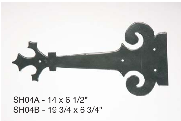
SH04A - 14 x 6 1/2" SH04B - 19 3/4 x 6 3/4"