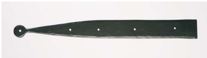
SH01 - 25 1/4 x 3"

Ever wondered what to call that hardware part? Visit us online at thedorstore.ca to see our glossary of common (and not-so-common) hardware terms.