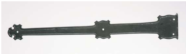
SH02 - 27 1/2 x 2"