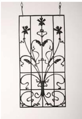
Iris : 19 1/4" x 38 1/2", cast aluminum