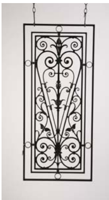
Versailles : 15" x 42", cast aluminum