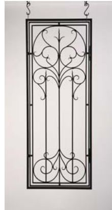
Lafayette : 20 3/4" x 59", wrought iron