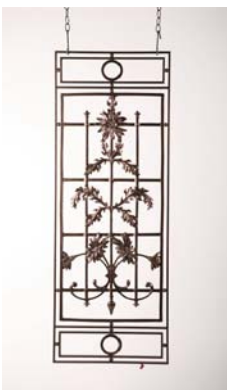
Toulouse : 19" x 42 1/2", cast aluminum