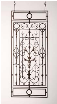
Paris : 20" x 38 1/2", cast aluminum

Since they are cast in moulds, these panels are the same size as the originals; by reframing them in steel and adding spacers and other details, and by varying the dimensions of the materials used, we can expand the size to fit most openings. We typically make these to be installed in two different ways: for doors with existing windows it is easier to mount the iron on the outside of the door using brackets that leave enough space between glass and iron to facilitate cleaning; for new doors, the iron can be set right into the door, usually flush with the face of the door, with just a little space between it and the glass. For easier glass cleaning, we also make a version on hinges so that the iron can swing open all the way. If you are interested in this type of treatment for your door, come in with the measurements and we'll see how we can make something fit. And remember, besides these aluminum panels there are many other designs and possibilities to chose from.